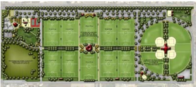
Tijuana River Valley Regional Park

multi-use synthetic softball fields, community play areas, 3 basketball courts, 3 tennis courts, bmx/skate park, 2 bocce ball courts, restroom, concession stands, photovoltaic power sources, and a water detention basin.