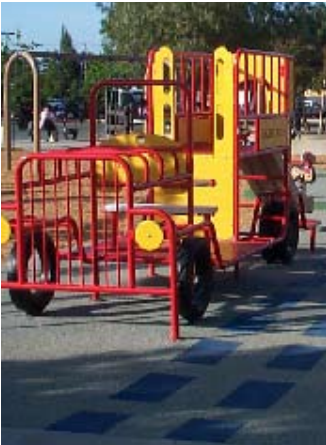
Houge Park's Themed Tot-lot

Beals Alliance developed designs and plans for the renovation of the play areas and restrooms, creating a thematic play experience for the neighborhood children. The community selected a transportation theme for the younger children, and a large scale play experience for the older children. Additional funding allowed the renovation project to extend to the adjacent picnic and plaza areas and new lighting for the park.