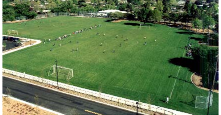
▶ Creekside Park Soccer Fields

Beals Alliance participated in a six month master planning phase that developed a community and City approved plan. Construction documents included a community building, pedestrian bridge, two large playgrounds, three soccer fields, community building, concessions, restrooms, play areas and half-court basketball. The fields are separated by alleys of trees and auto circulation. This accomplishes a neighborhood feeling even though the park is 13 acres.