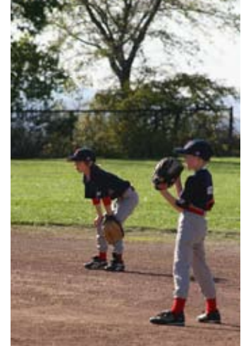
▶ Our Youth Benefactor Program helps leagues provide safe and enjoyable competitive sports experiences