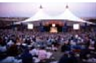
Shoreline Amphitheater ◀