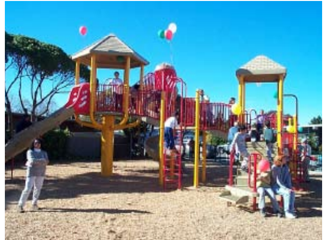
▶ Concar Park Play Area