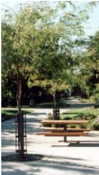
Country Club School Park ◀