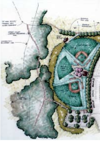
Cordelia Tri-Valley Little League ▶

Beals Alliance developed a preliminary plan for this Little League complex. The plan included two Little League baseball fields with a support building located between the two backstops. The Cordelia Tri-Valley Little League fields were completed as part of Beals Alliance's Youth Benefactor Program.