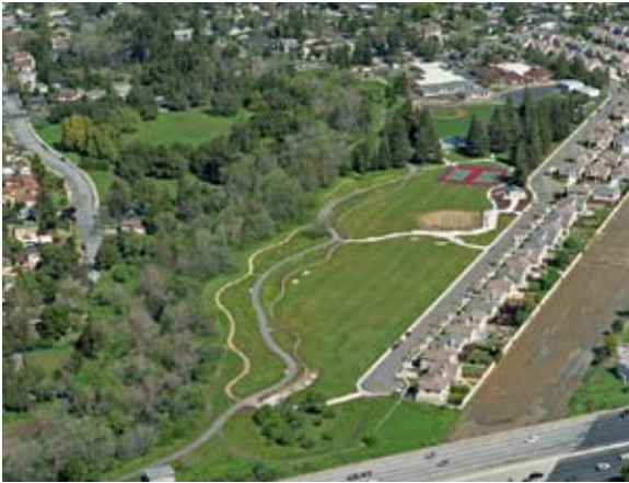
Selma Olinder Park