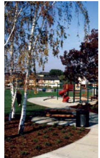
▶ Klein Park

Beals Alliance has accomplished projects such as: