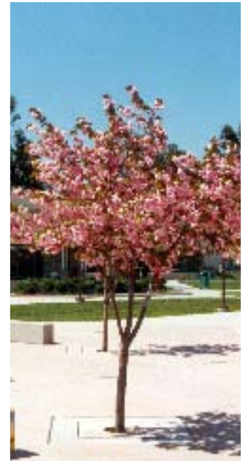
San Jose Children's Shelter