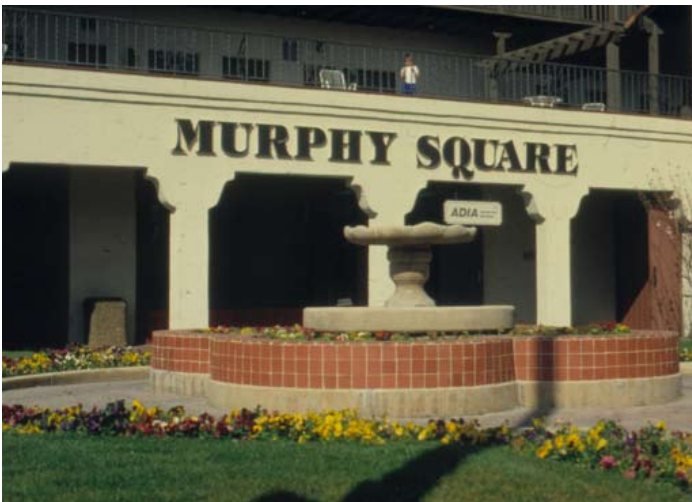
Murphy Square ◀

San Jose, CA San Jose Beautiful, Redevelopment Agency of San Jose, and the San Jose Departments of Public Works, Traffic, Planning, Parks and Recreation