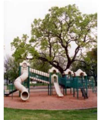
Three Oaks Park