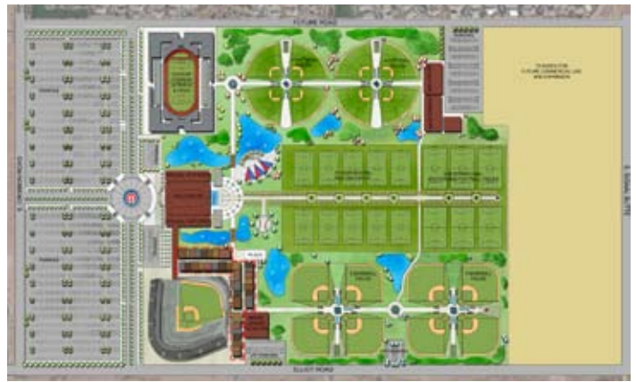
▶ Chicago Cubs Training Facility/ Legacy Sports Park

The Legacy Sports Park of Mesa, LLC consulted with Beals Alliance to create a Master Plan for the construction of the new spring training facility being designed exclusively for the Chicago Cubs. They will be a cornerstone partner with a state-of-the-art $225 million dollar, 300-acre, year-round property that is a destination for sports fans.