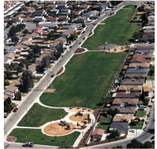
▶ Lo Bue Park