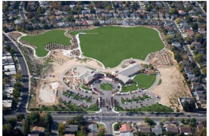
▶ South Natomas Community Park

Beals Alliance developed a new Master Plan for the park after conducting meetings with staff and community members, who helped to determine expectations. The Master Plan includes a multi-use sport field with a 75 x 120 yard soccer field, softball field, basketball court and play area. The Plan utilizes an "orchard" theme in keeping with the area's rural roots. The tot lot and play area have a ranch theme conveyed by overhead entrance signage and a large windmill. The landscape is graded with small berms to represent rolling hills.