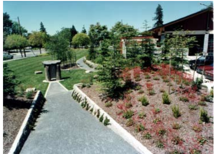
▶ Dana Park