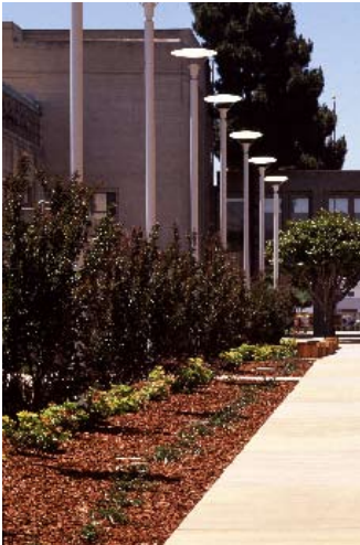
▶ Monterey County Government Center