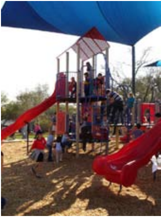
Patriots Park ◀