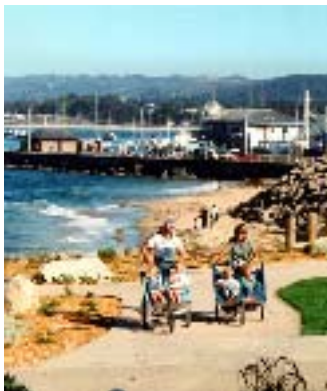
San Carlos Beach ◀