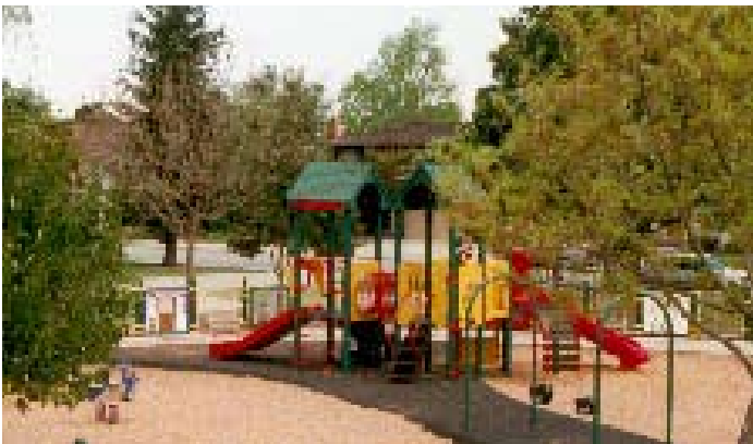
Doerr Park Play Area ◀