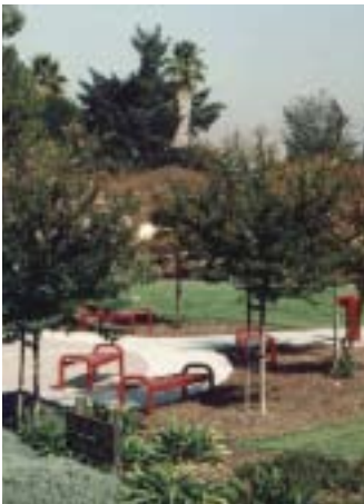
Renz Park Demonstration Gardens ◀

Beals Alliance developed a Master Plan of 13.6 acre Jan Drive Park for the Carmichael Recreation & Park District. Jan Drive Park site is an underdeveloped neighborhood park which includes a riparian area with seasonal water. The Master Site Plan includes connectivity to the surroundings, development of the trail system, group and individual picnic areas, and other passive recreational opportunities.