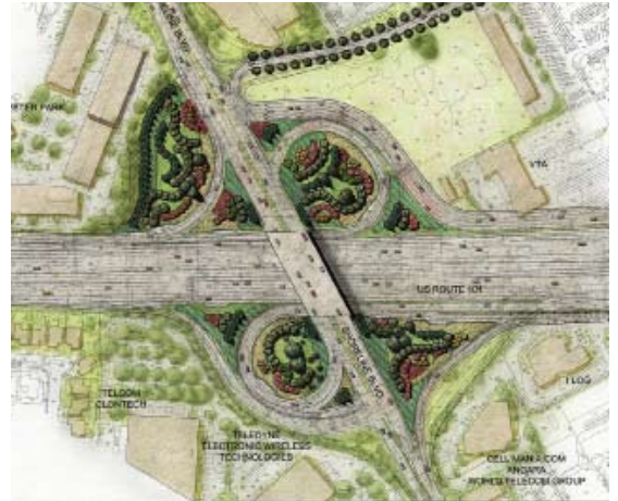
▶ North 85/101 Highway Interchange