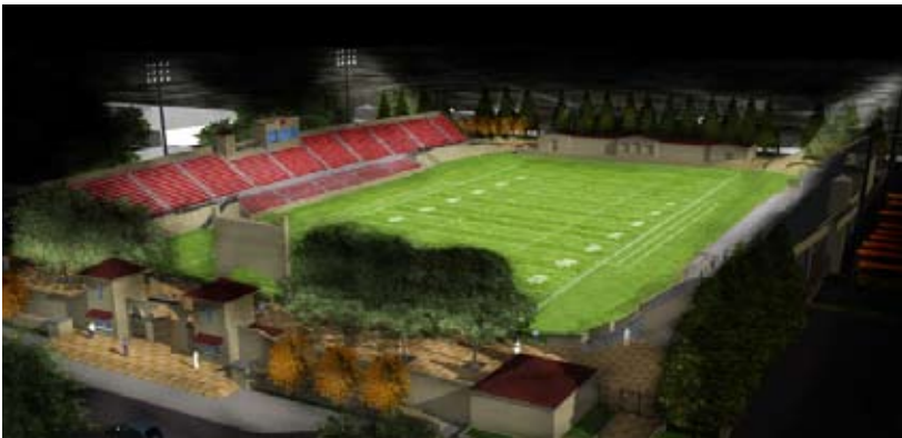
▶ Napa Memorial Stadium

Architects, took on the challenge of modernizing the stadium to provide the necessary modern amenities and to bring the highly regarded stadium into the 21st century. The new stadium scheduled to open in fall of 2010 will encompass renovated parking, ticket entries, concessions, restrooms, press boxes, elevators, handicap accessible bleachers, team rooms, entry plaza, scoreboard, rain water harvesting, and a state of the art synthetic field.