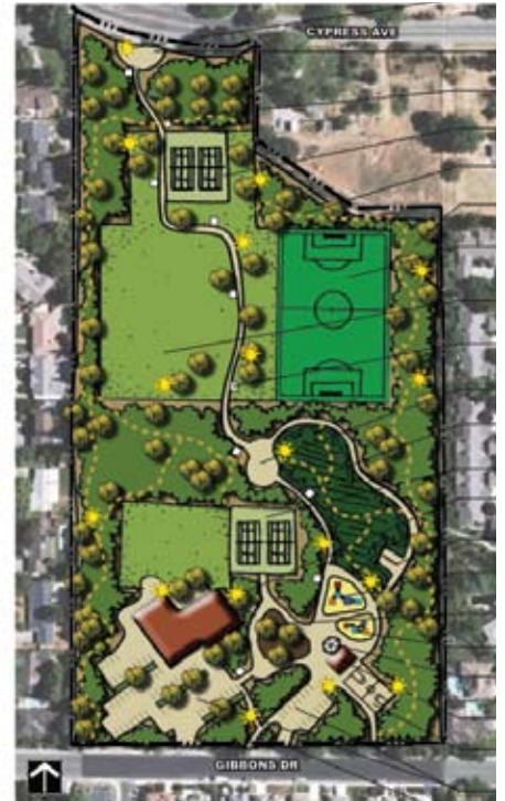
Gibbons Park Sustainability Plan

Beals Alliance created a sustainability assessment of the 17.5 acre Gibbons Park for the Mission Oaks Recreation and Park District, which identifies the highest and best use of the landscape that respects the environmental, economical, and social factors of the site. The study addresses a variety of sustainable design topics, including topography, soils, water, vegetation, and energy.