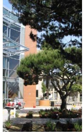
▶ Monterey County Government Center Entry Way

The County of Monterey remodeled their Government Center and add a State Courthouse. The landscaping of this new building needed to be low maintenance and very water efficient, but it also had to reflect the important function of the courthouse. Pine trees were placed near the three story glass entry way. A “mall” of lush, flowering trees were planted to add a monumental feel reminiscent of the cherry trees in the Capitol Mall in Washington, D.C. With the development of the other buildings in the government center, landscape details were judiciously introduced in appropriate areas to appear as if they had been there for the past 50 years. Old fountains were renovated so the calming sound of water could again be heard along the mall. Special care was taken with the lighting elements to provide security, yet not overpower the area. Along with pedestrian level bollards, gently-scaled light standards and up-lighting were used for dramatic impact.