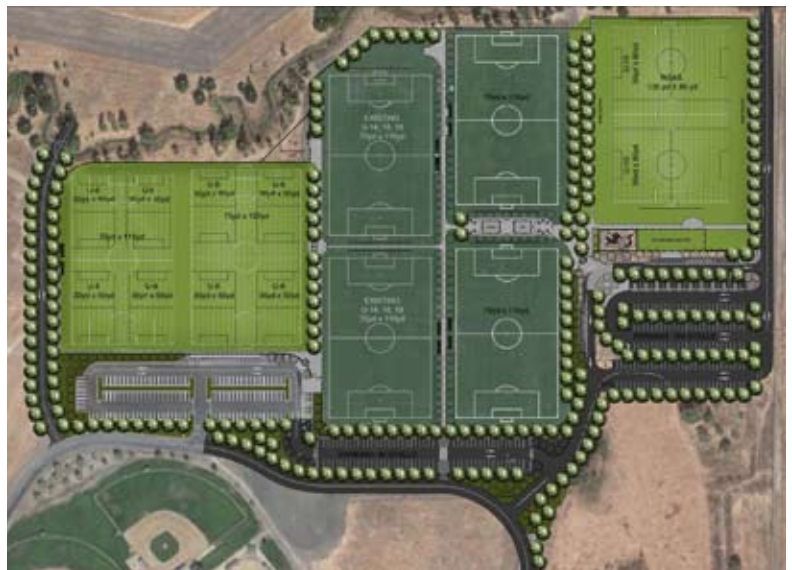
▶ Horse Creek Soccer Complex at Centennial Park

This 40 acre park currently has 1 Pony League/ Babe Ruth field, 3 Little League fields, 4 VYSL soccer fields, outdoor roller hockey court, 4 tennis courts, a hiking trail, on-site parking for approximately 300 cars, restroom and concession complex. We have master planned for soccer fields and updating of ADA.