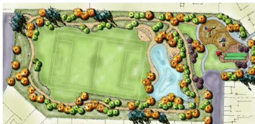
▶ Holly Creek Park includes a soccer field and water feature