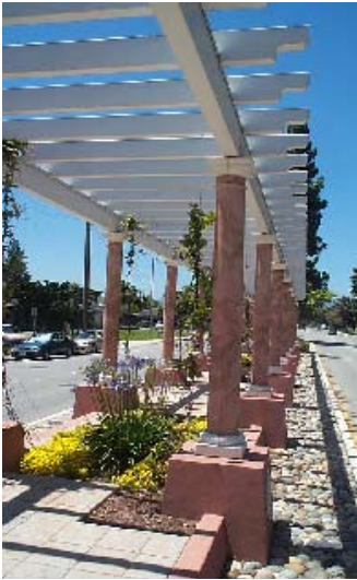
Saratoga Avenue ◀