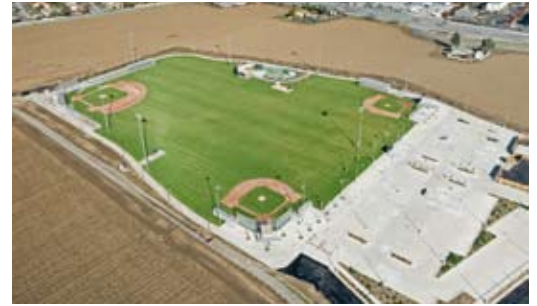
▶ Gilroy Sports Park

The design for this multi-use sports complex maximizes the use of a 1% flood plane area. A 2-in-1 design places soccer fields between baseball/softball fields. Two of these configurations are located side by side split by a walkway which links all facilities to the central driveway and parking spine. Programmatic and fiscal participation from the Little League and soccer leagues have resulted in plans for a premier facility in the southeast corner of the site.