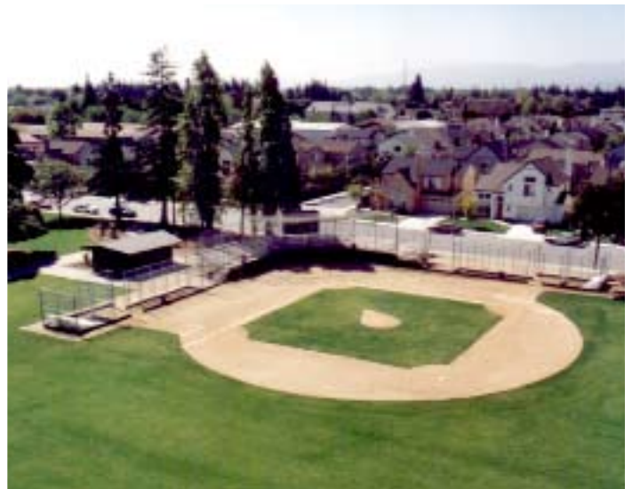
▶ Washington Sports Park