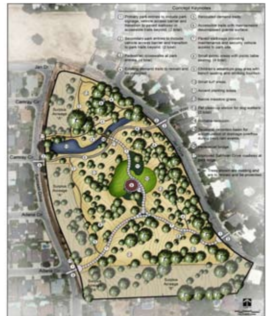
▶ Northwoods Park

Developing the connectivity of existing residential parks, Beals Alliance developed a two phase master plan of a recreational trail system expansion from existing Northwoods park for Sunrise Recreation & Park District. A two part master plan was develop based upon community members responses that maintained an the overall passive, natural and open feel of the existing Northwoods park site, while also providing focused areas of development to enhance new user group experiences.