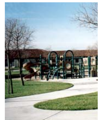
Calaveras Neighborhood Park