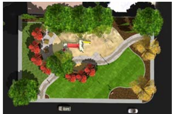
▶ Max Baer Park, Sacramento