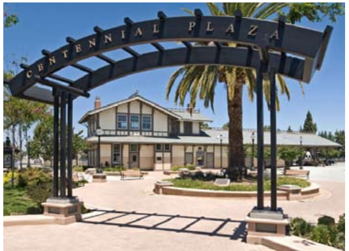
▶ Centennial Plaza* *APWA Honor Award

City of Fremont Development & Environmental Services Department