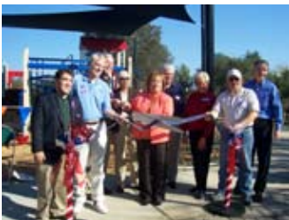
Ribbon cutting on grand opening day at Patriots Park

Sacred Heart Schools, Atherton, CA, 2005