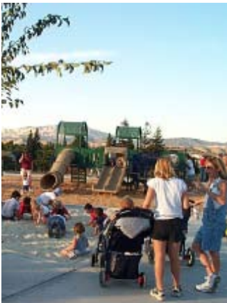
Memorial Park Play Area ▶