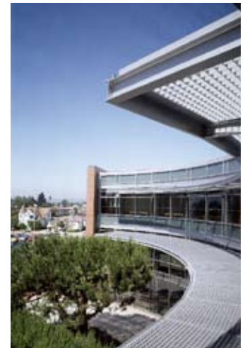
▶ Monterey County Government Center