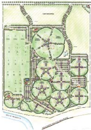
▶ Tracy Youth Sports Facility

Working with soccer representatives, City of San Jose, City of Morgan Hill and Morgan Hill Unified School District, Beals Alliance developed several iterations of the design to meet the needs of each interest group. Twenty full size soccer fields were included along with parking, corporation yard, entry ticketing area, and a central tournament area.