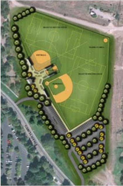
◀ Shoreline Athletic Complex

The complex consists of one large multi-use synthetic turf field which is located atop the region's old closed shoreline landfill site. The multi-use facility can be programmed for a multitude of community uses including 2 adult or little league baseball fields/slow or fast pitch softball fields and can also be striped to hold 2 adult soccer fields or multiple u8/u10 kids soccer fields. The facility will also have a restroom/concession building, sports field lighting, play areas and new landscaping.