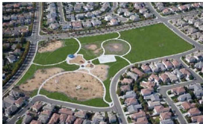
Burberry Park ▶