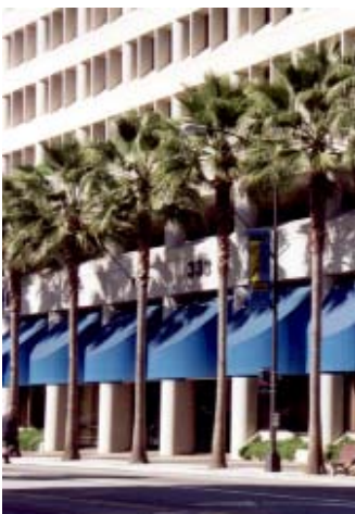
Santa Clara Street ◀