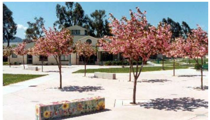
▶ San Jose Children's Shelter