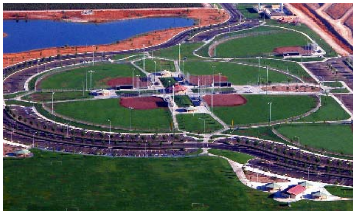
Fresno Regional Park ◀

Using a shoreline landfill, the City of Fresno and Beals Alliance transformed a former city dump to a state-of-the-art sports park. The park includes six adult league softball fields featuring centralized concessions and restrooms. Fifteen soccer fields support play for under-8 divisions to regulation tournaments.