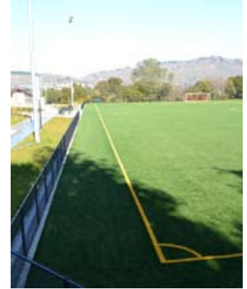
▶ Dan Foley Park

*CARPD Best Renovated Facility Award Winner