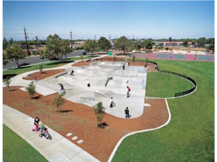
▶ Plata Arroya Skatepark