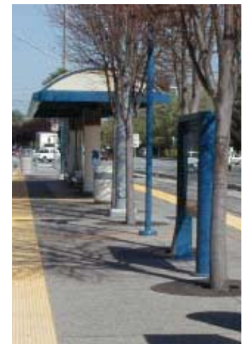
▶ VTA Light Rail Platform