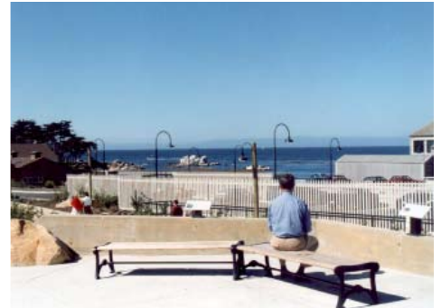
▶ Monterey Bay Aquarium