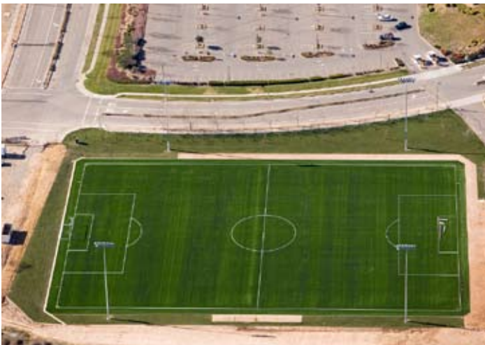
Granite Regional Park ▶

Albany-Berkeley Youth Sports Complex Albany, CA