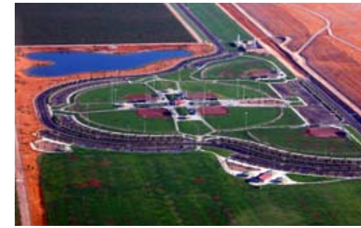
Fresno Regional Sports Complex