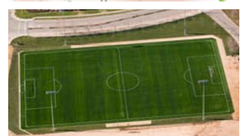
Granite Sports Complex