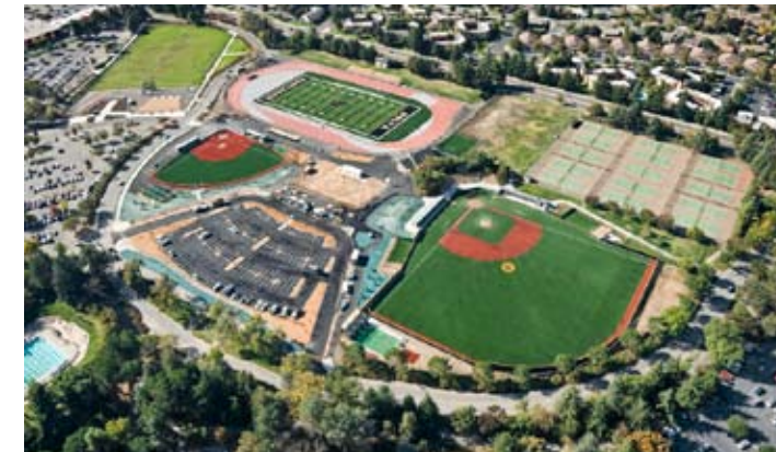
Delta College, Stockton, CA ASBA Distinguished Sports Field Award Winner ASBA Distinguished Running Track Facility Award Winner

Beals Alliance provides clients with expertise in designing public outdoor environments, including of parks, waterfronts, public plazas, transportation hubs and stops, streetscapes, bicycle and jogging trails. In addition to our public design expertise, our clients benefit from our long experience inworking in the public sector with many different stakeholders. We understand the importance of the public process as well as its challenges and benefits. We've completed over 200 park and public facilities in Northern California—projects which have included community-wide planning workshops, addressing The concerns of special interest groups, park master planning and design, rehabilitation and implementation. Our work encompasses communities of varying sizes and cultures, each one presenting unique challenges and opportunities.