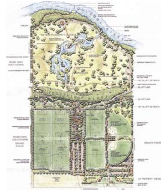
Riverbluff Regional Park