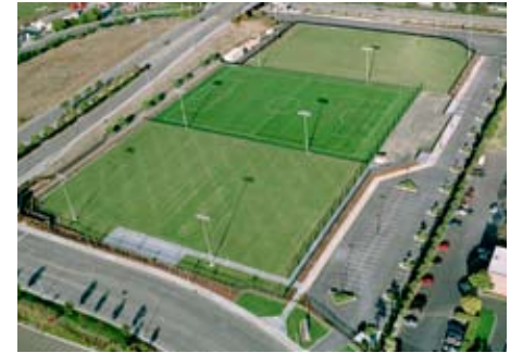
Santa Clara Soccer Complex