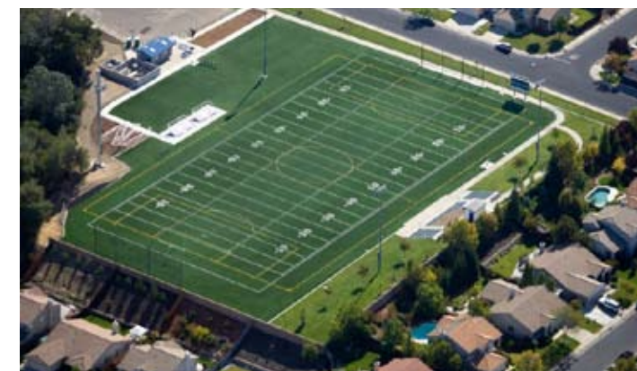
Livermore Park, Folsom, CA ASBA Distinguished Multi-Purpose Turf Facility Award Winner