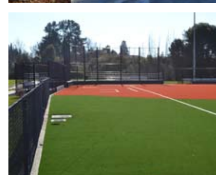
Dan Foley Sports Park