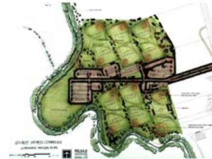
Gilroy Sports Complex