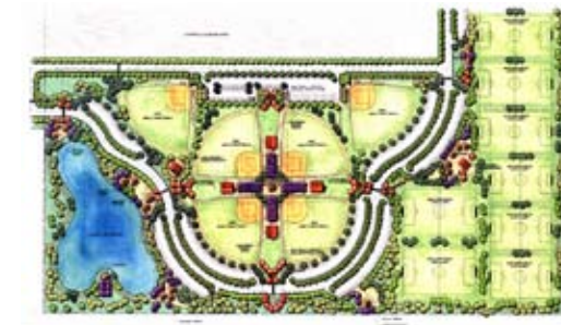
Riverbank Sports Complex