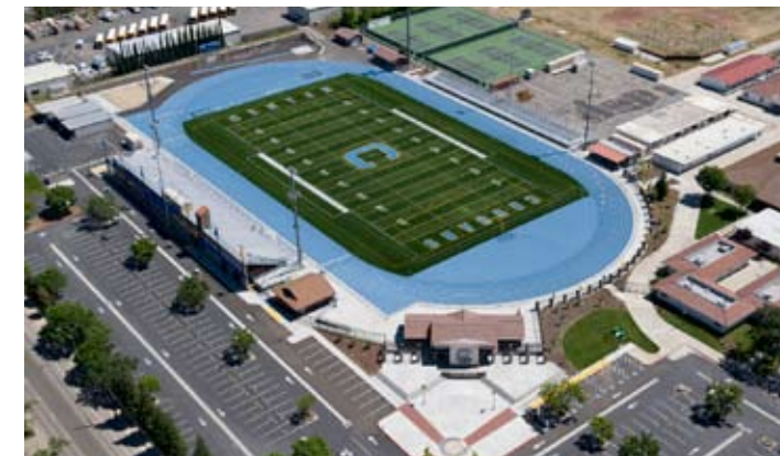
Center High School, Antelope, CA ASBA Distinguished Outdoor Track Award Winner