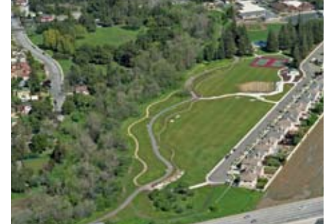
Selma Olinder Park