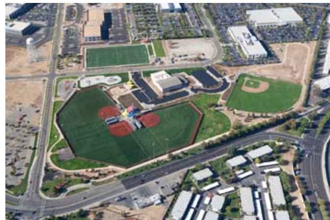
Mather Sports Center, Mather, CA ASBA Multi-Purpose Turf Facility of the Year Award Winner CPRS Facility Design: Sports Field/Complexes Award Winner

Over the past ten years, our design team has earned over 40 awards for superior design and project process planning. Our passion for delivering comprehensive planning, creative design options, responsive construction administration and exceptional customer service is what drives our success.