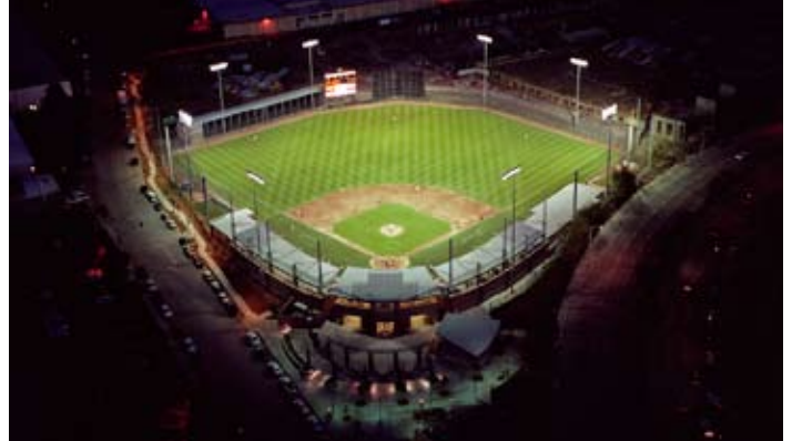
▶ Santa Clara University Santa Clara, CA

Santa Clara, CA Athletic master plan and design for Bellomy field, Buckshaw/Stanton Field, and new Schott Baseball Stadium design