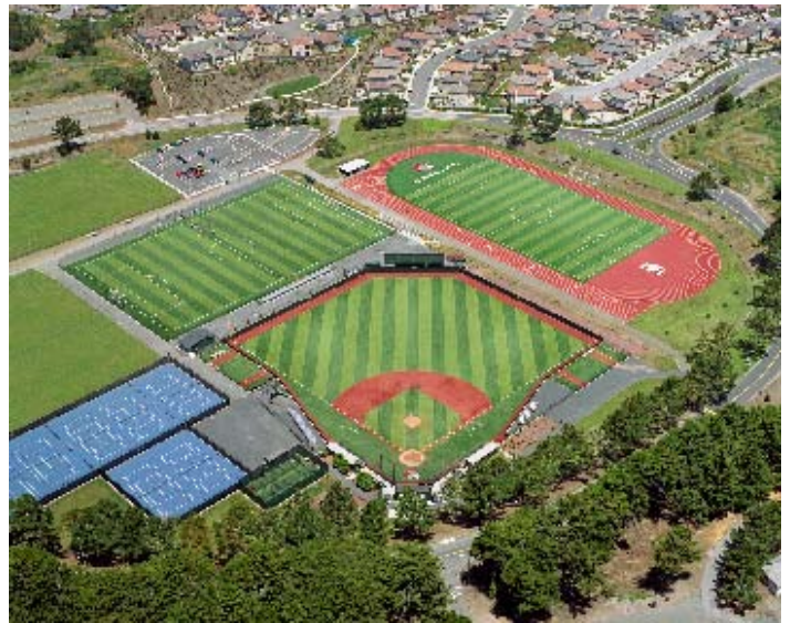
▶ San Mateo County Community College District Skyline College San Mateo, CA