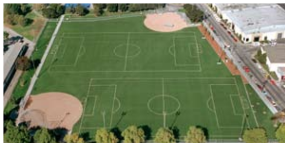
Hoover School Park Redwood City, CA