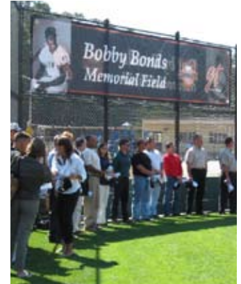
Bobby Bonds Memorial Field JFK Elementary School Daly City, CA

Master plan renovation design and construction documents