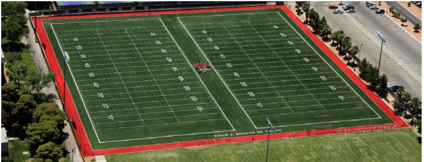
▶ University of Nevada Las Vegas

Rocklin, CA Natural turf, multi-use soccer and athletic field Master Plan of New Athletic Facility