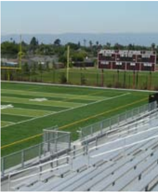
East Side Union High School District Piedmont Hills High School San Jose, CA