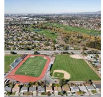
ASBA Outstanding Track Complex Andrew Hill High School San Jose, CA 2005