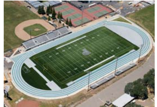
El Dorado Union High School District Ponderosa High School Placerville, CA

*ASBA Outdoor Track of the Year Award 2010 for Ponderosa High School