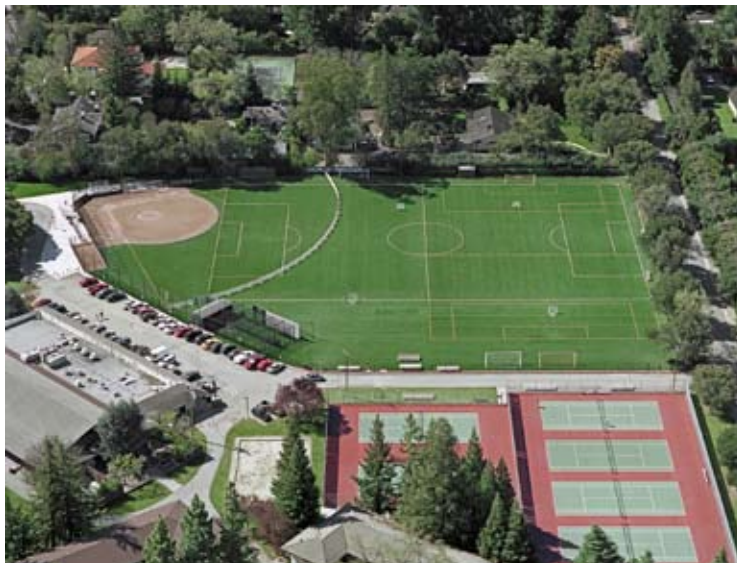
▶ Menlo School Atherton, CA