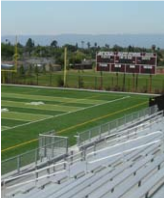
ASBA Outstanding Track Complex Piedmont Hills High School San Jose, CA

Sacred Heart Schools, Atherton, CA, 2005