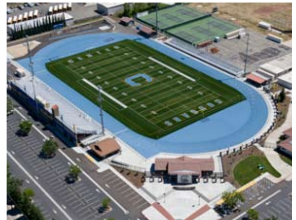
Center Unified School District Center High School Antelope, CA