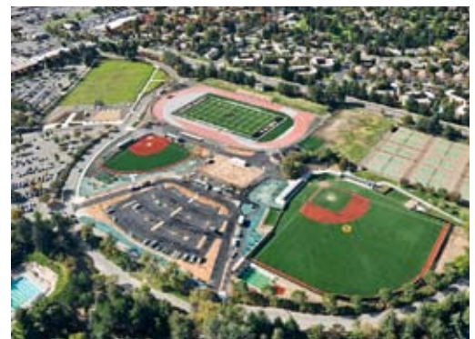
▶ Delta College Stockton, CA