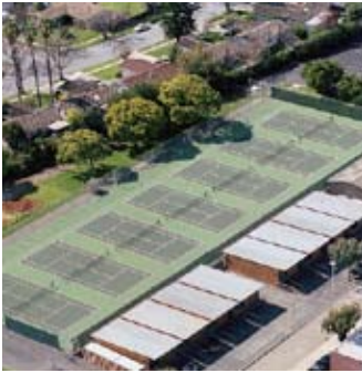
Fremont Union School District Lynbrook High School San Jose, CA