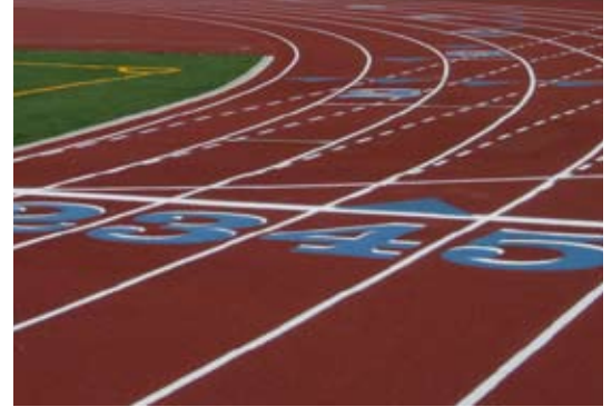
▶ Track Starting Line

*ASBA Outstanding Track Complex 2005 for Andrew Hill High School