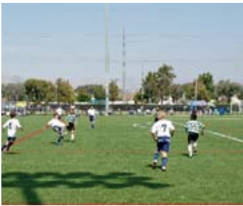
▶ City of Santa Clara Soccer Park Santa Clara, CA

Santa Clara, CA Premier FIFA regulation soccer fields-1 synthetic & 2 sand-based