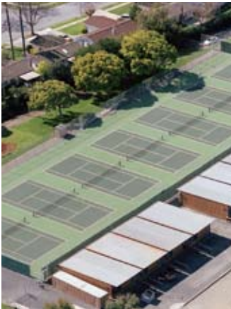
◀ Fremont Union High School District Lynbrook High School San Jose , CA

Fairfield, CA Solano College Renovation of complex 12 courts