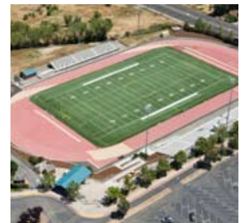
Elk Grove Unified School District Sheldon High School Elk Grove, CA

*ASBA Outstanding Track Complex 2006 for Armijo High School