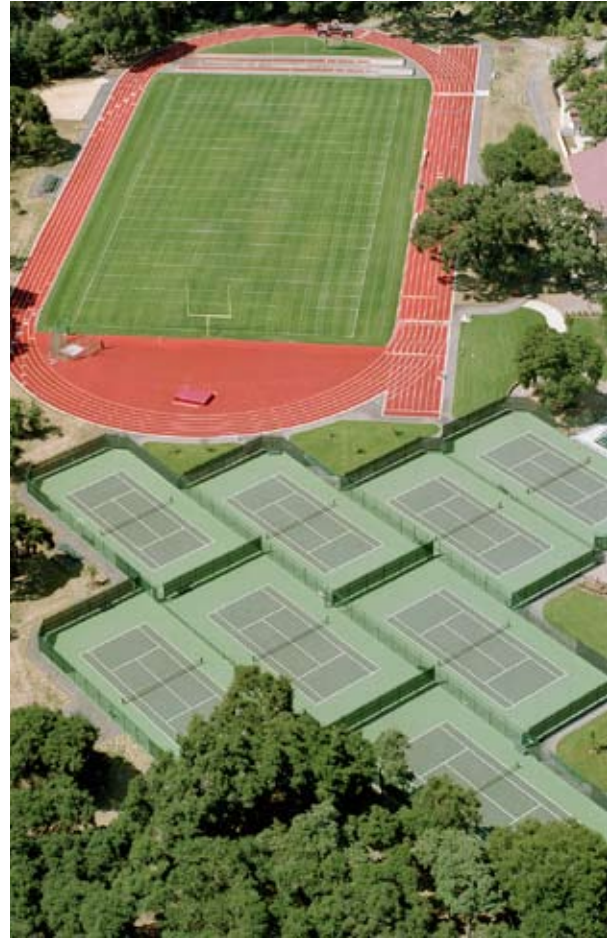
▶ Sacred Heart School Atherton, CA