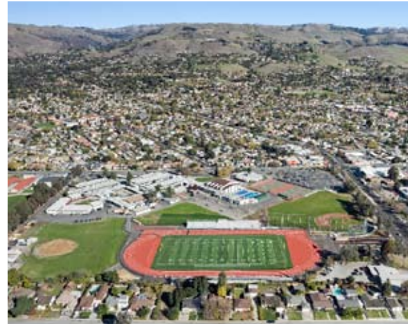
▶ James Lick High School San Jose, CA

Antelope, CA Center High School Football Field *ASBA Distinguished Track Facility 2010