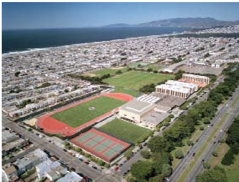
▶ St. Ignatius College Preparatory School San Francisco, CA