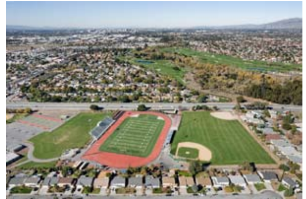
East Side Union High School District Andrew Hill High School San Jose, CA

Renovation of two baseball fields, practice football field, 3 tennis court relocations and parking lot