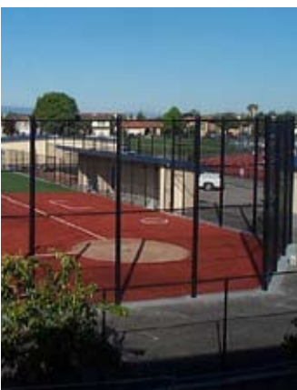
Milpitas Unified School District Milpitas High School Milpitas, CA

Assessment and Master Planning of Facilities