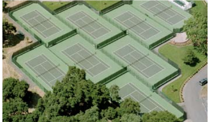
▶ Sacred Heart School Atherton, CA

Cupertino High School, Cupertino, CA Fremont High School, Sunnyvale, CA Homestead High School, Sunnyvale, CA Lynbrook High School, San Jose, CA Monte Vista High School, Cupertino, CA 35 renovated and/or reconstructed tennis courts