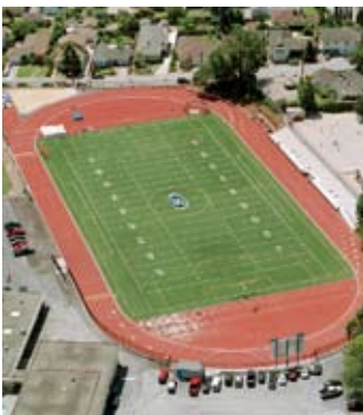
▶ Junipero Serra High School San Mateo, CA