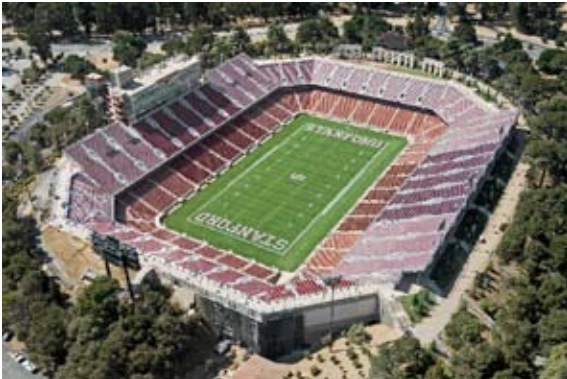
▶ Stanford University Palo Alto, CA

Palo Alto, CA Consulted on new football field in Stanford stadium