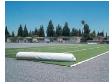
▶ Installation of synthetic turf field

San Jose, CA Andrew Hill High School James Lick High School Oak Grove High School Piedmont Hills High School Santa Teresa High School Yerba Buena High School Football/Soccer Fields