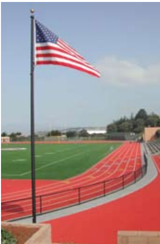
St. Ignatius College Preparatory San Francisco, CA