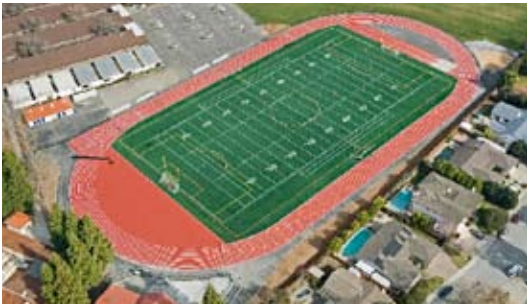
Mountain View-Whisman School District Graham Middle School Mountain View, CA

All-weather track, synthetic turf field, natural turf fields, hardcourts, restrooms, stands and concessions