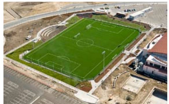
▶ Las Positas College Livermore, CA

Placerville, CA El Dorado High School Ponderosa High School Union Mine High School Oak Ridge High School Synthetic turf fields & new running tracks *ASBA Outdoor Track of the Year Award 2010 for Ponderosa HS