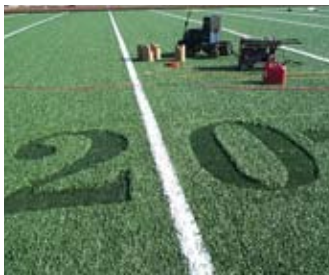
Football field: installation of yard line numbers

Monterey Trail High School Sheldon High School Valley High School Football/Soccer Field *ASBA Outstanding Track Complex Award 2010 for Sheldon High School