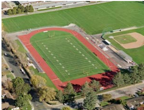
Mountain View High School Mountain View, CA

Milpitas, CA Milpitas High School Football/soccer and all-weather track stadium, baseball and softball synthetic fields