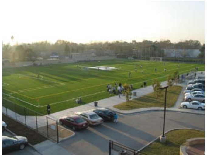
▶ Bellarmino College Preparatory San Jose, CA

Synthetic turf football and soccer fields reconstruction, track improvements and baseball field modifications