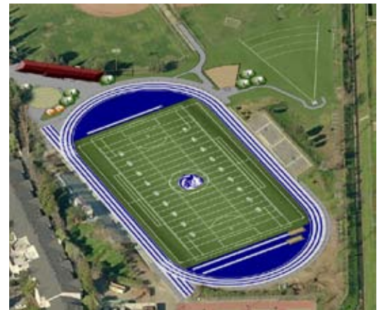
▶ Capital Christian School Sacramento, CA

New all-weather track and field events and new synthetic turf field