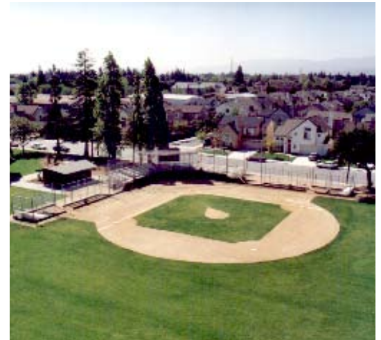
San Jose Unified School District Washington Elementary School, San Jose